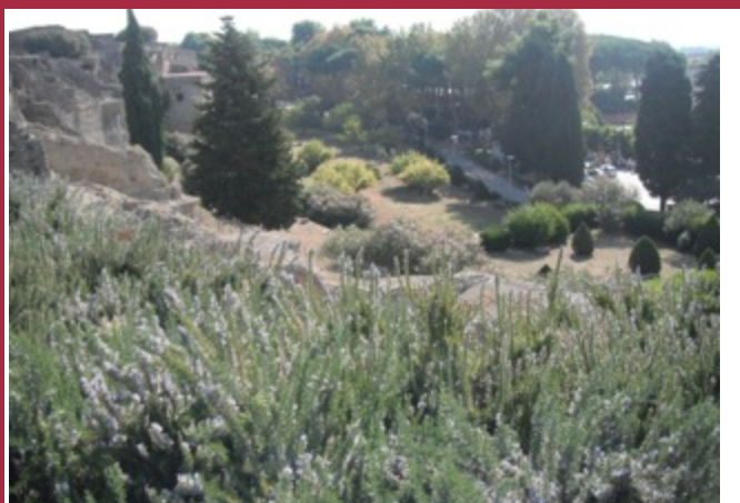
Hillside at Pompeii, Italy