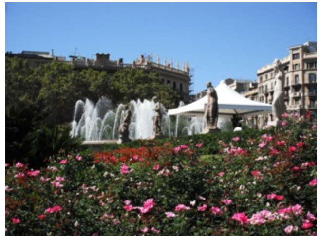
Rose garden in Barcelona, Spain